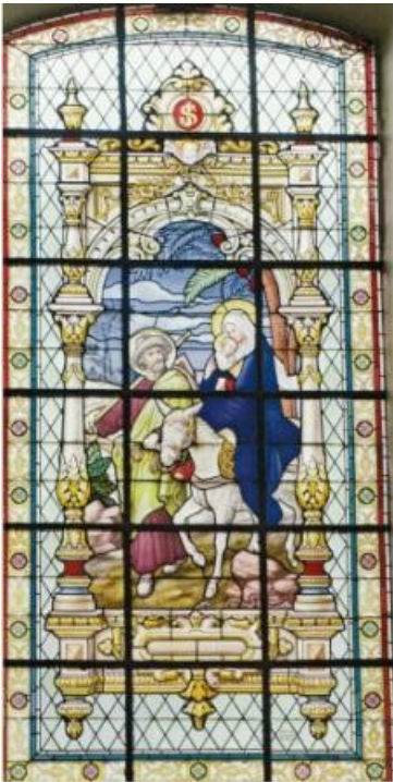
The Flight into Egypt