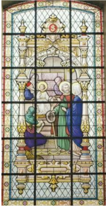
The boy Jesus in the Temple