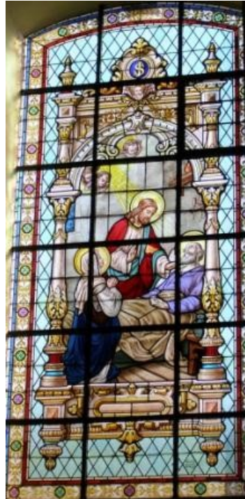
The death of Joseph