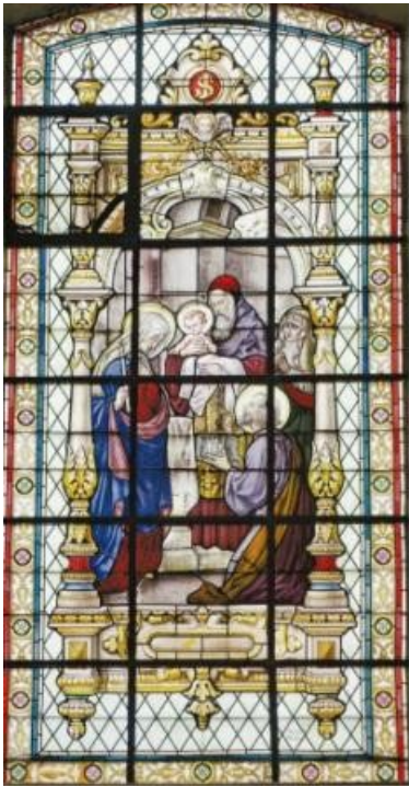
The prophecy of Simeon