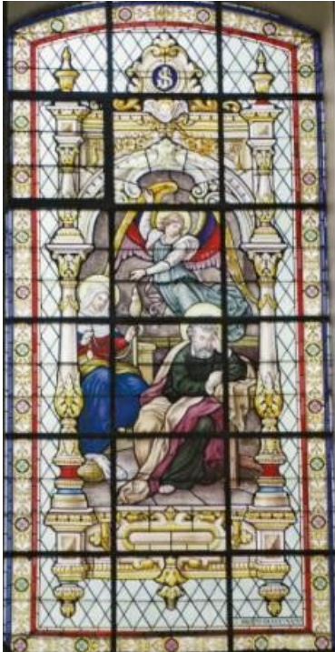
The Angel speaks to Joseph in a dream

So the role of Joseph, as head of the household, is to provide for the needs of his family, and to encourage and support both Mary and Jesus. His own pride comes from their achievements, and his own joy from their happiness.