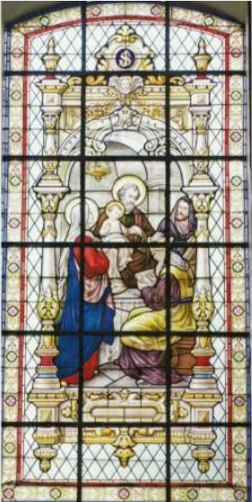
The Circumcision of Jesus