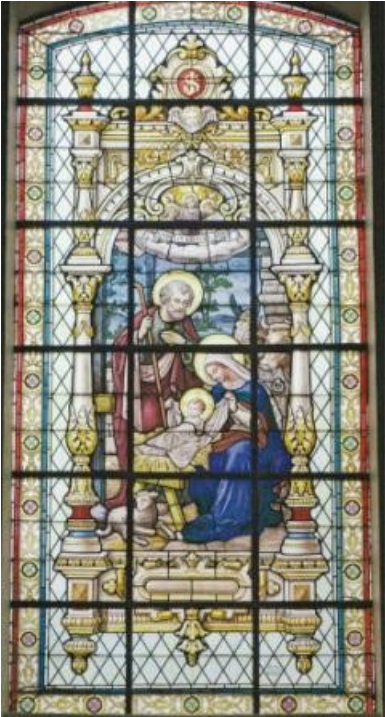
The birth of Jesus