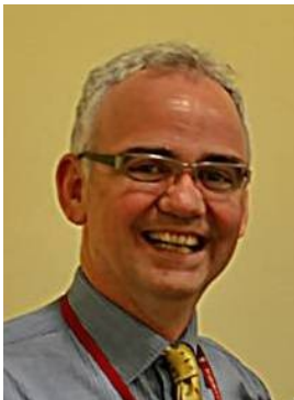
Antony Hudson Junior School Weybridge

In maart 2011 bezoeken vier directeurs het Collège St. Etienne à Kinshasa – Limete.