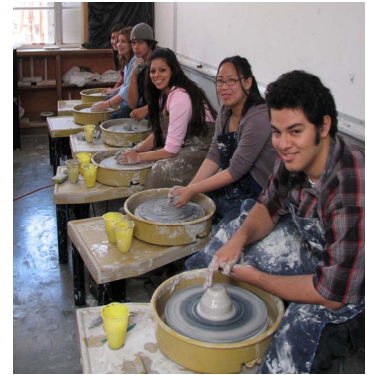
STUDENTS AT POTTERS WHEEL